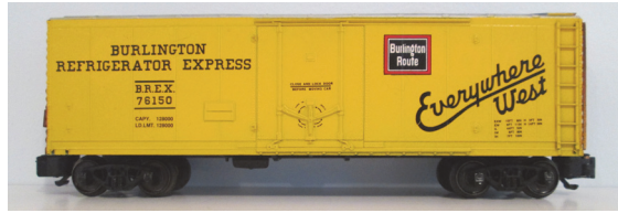
Car #1 Side B

Sets will have two additional Burlington cars with the following numbers & graphics All cars will have yellow sides, silver roof, and red ends All cars HiRail with AF type couplers Manufactured by American Models