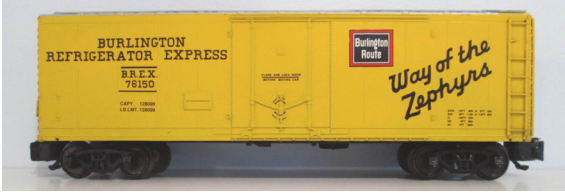
Car #1 Side A